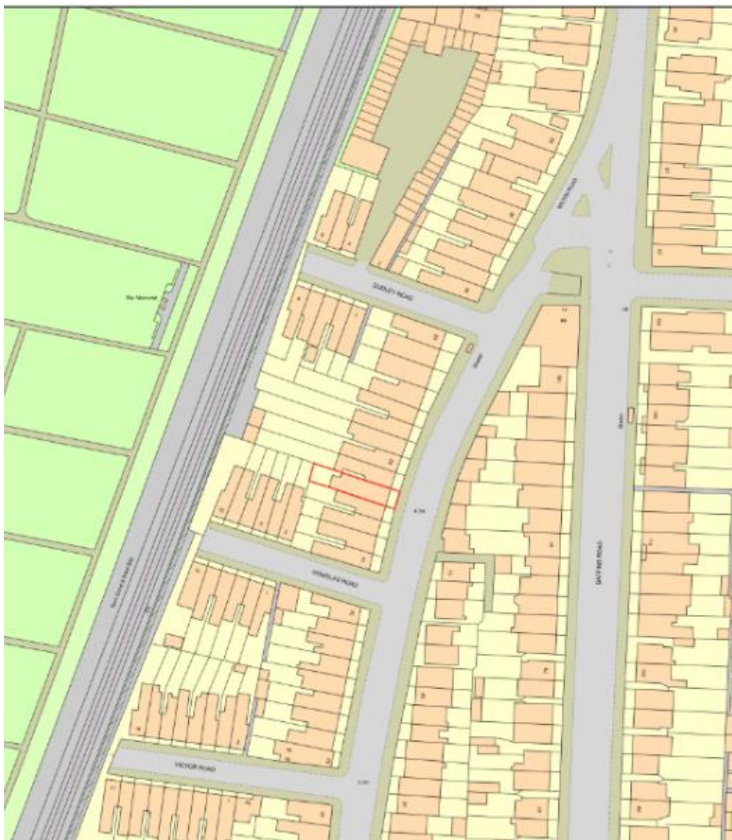
Figure 1 Location plan