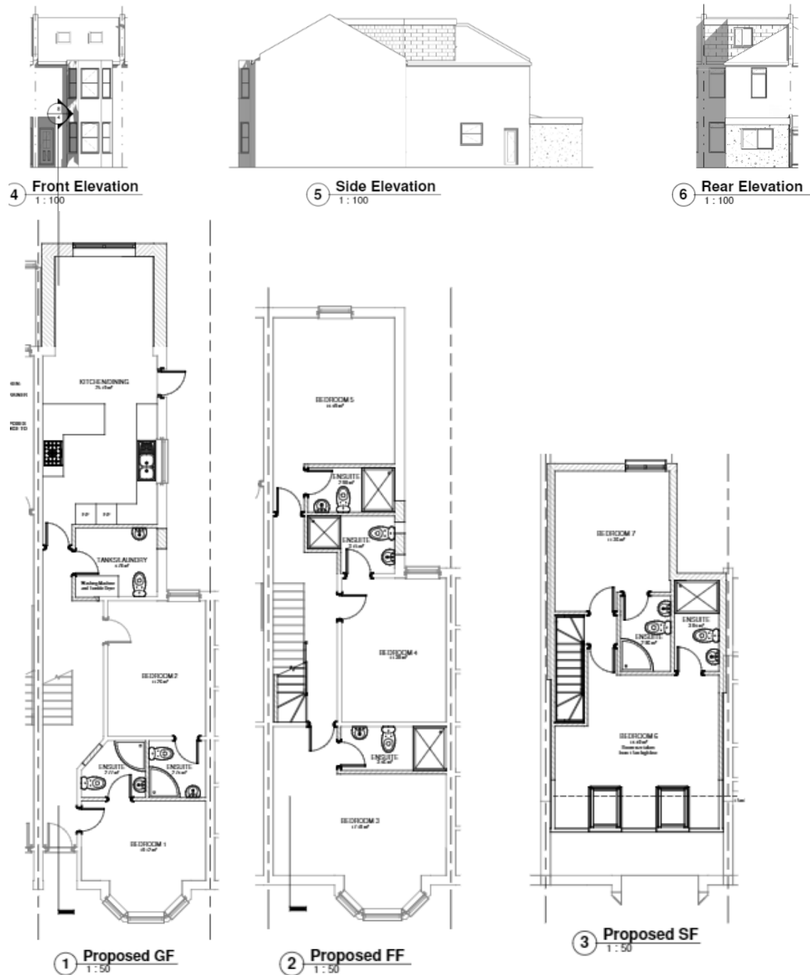
Figure 2 Proposed Floor Plans & Elevations